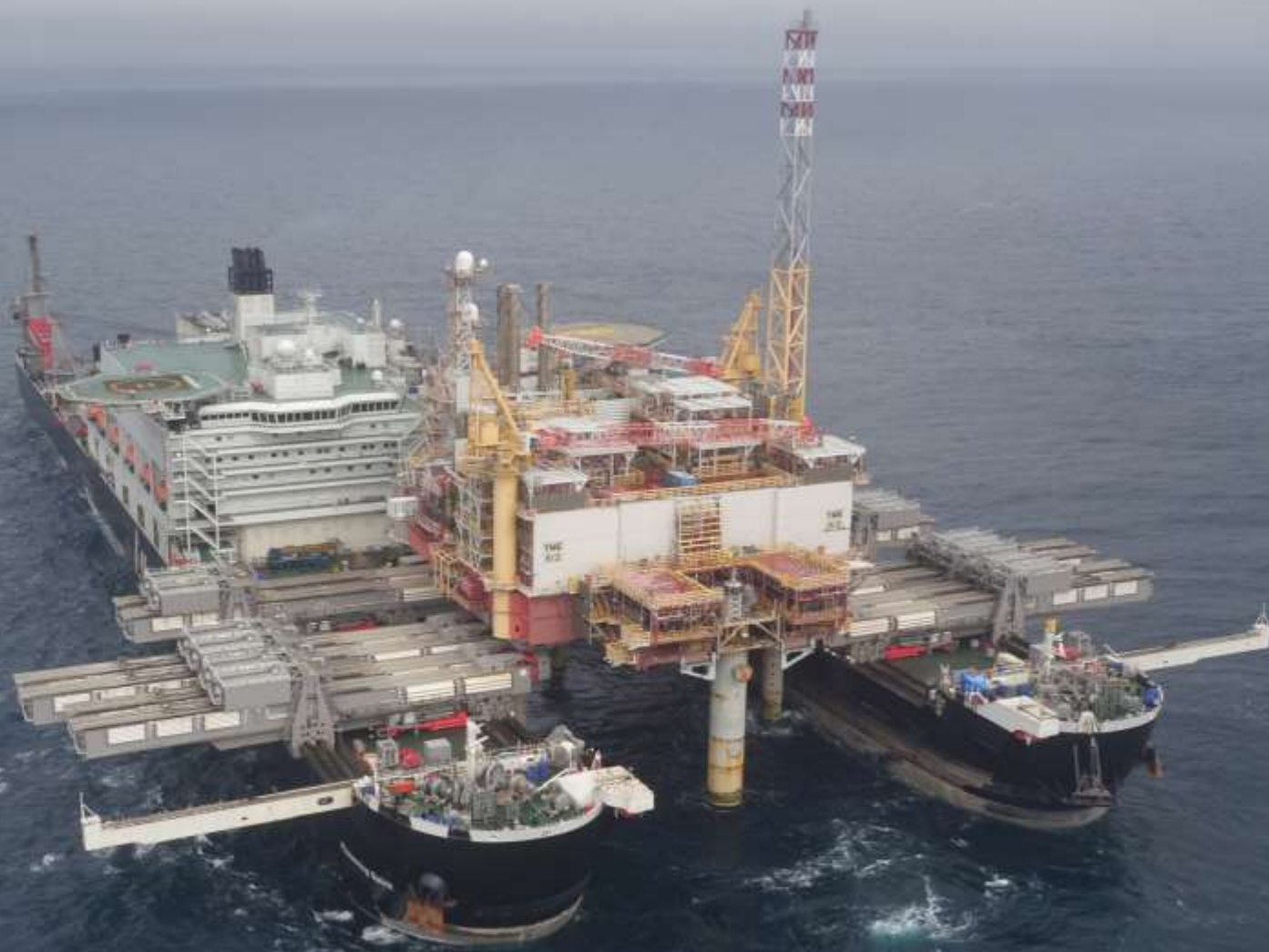
Pioneering Spirit connected to Yme platform, 22 August 2016 Yme field, Norwegian sector of the North Sea