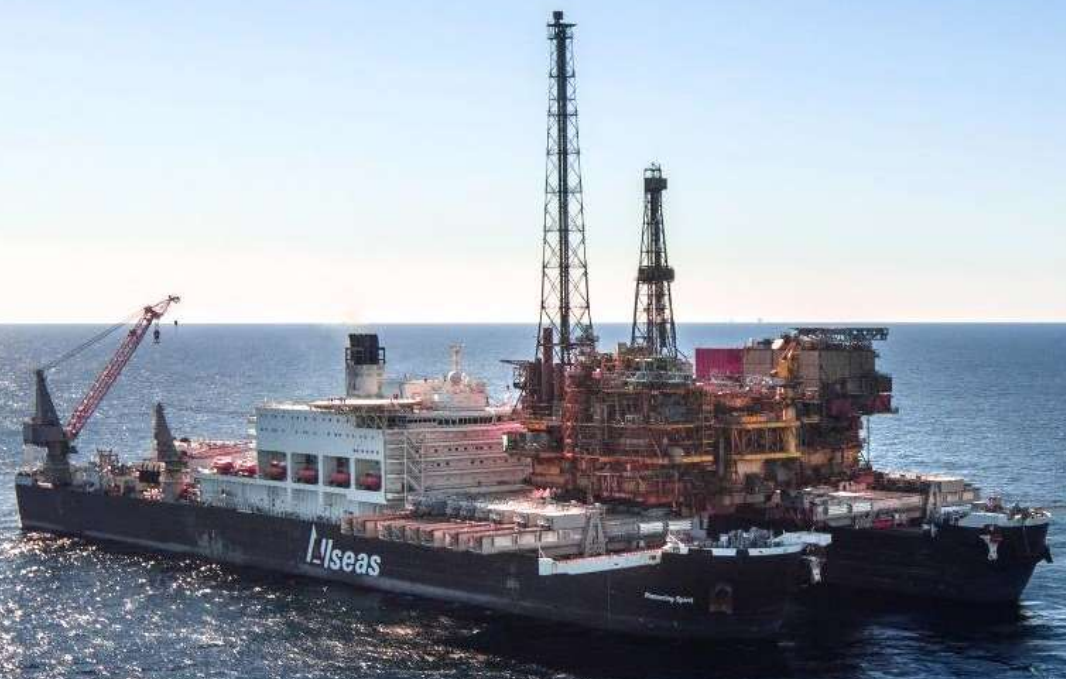
Moving out from the platform legs, 28 April 2017