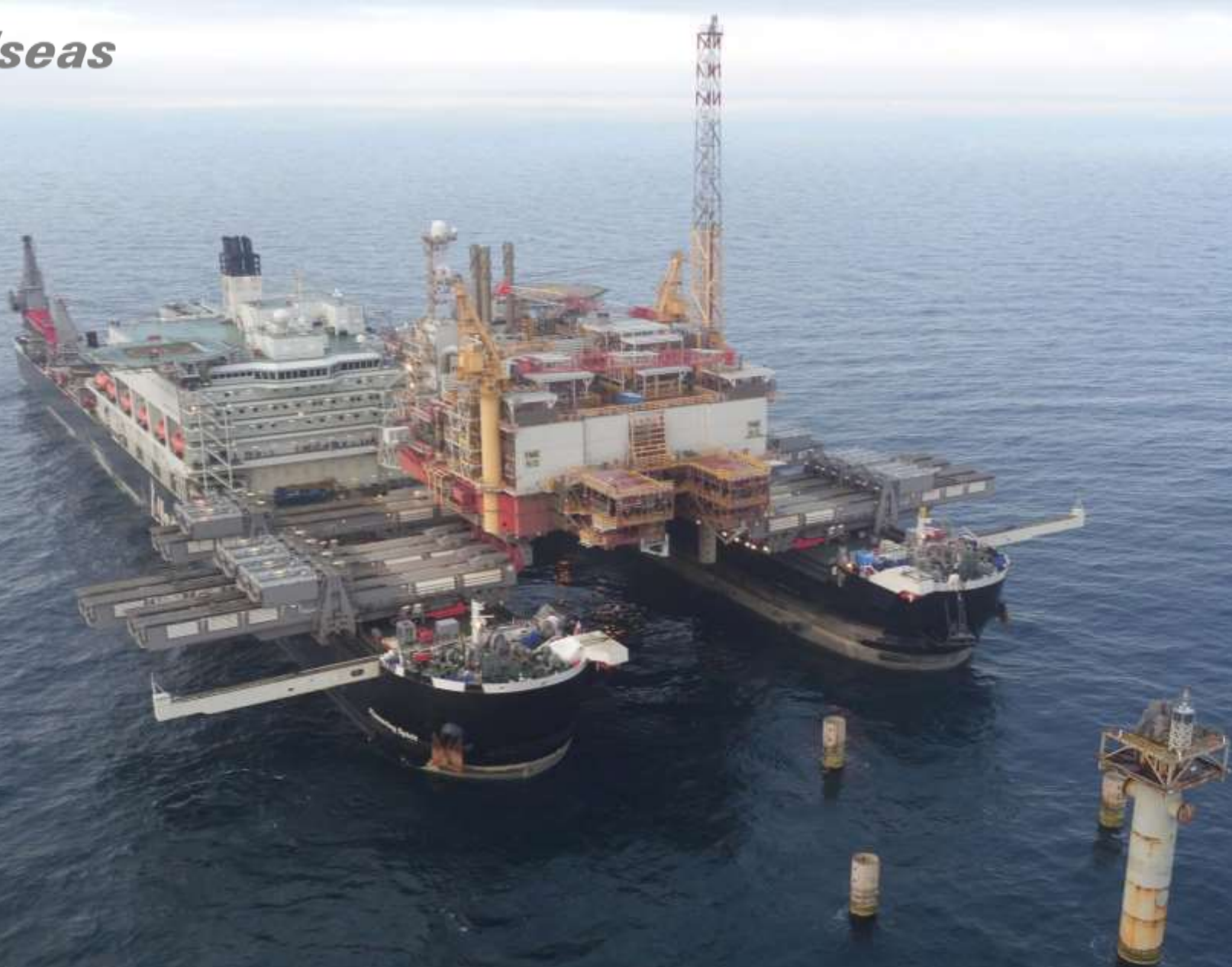
Pioneering Spirit moving out of the 500 m zone, 22 August 2016 Yme field, Norwegian sector of the North Sea