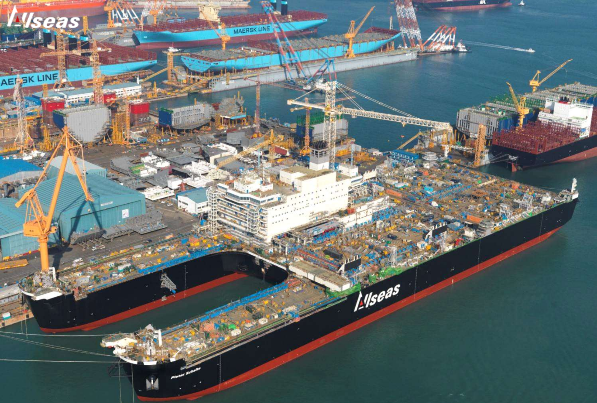
Pieter Schelte alongside the D-quay, December 2013 Daewoo shipyard, Okpo, South Korea