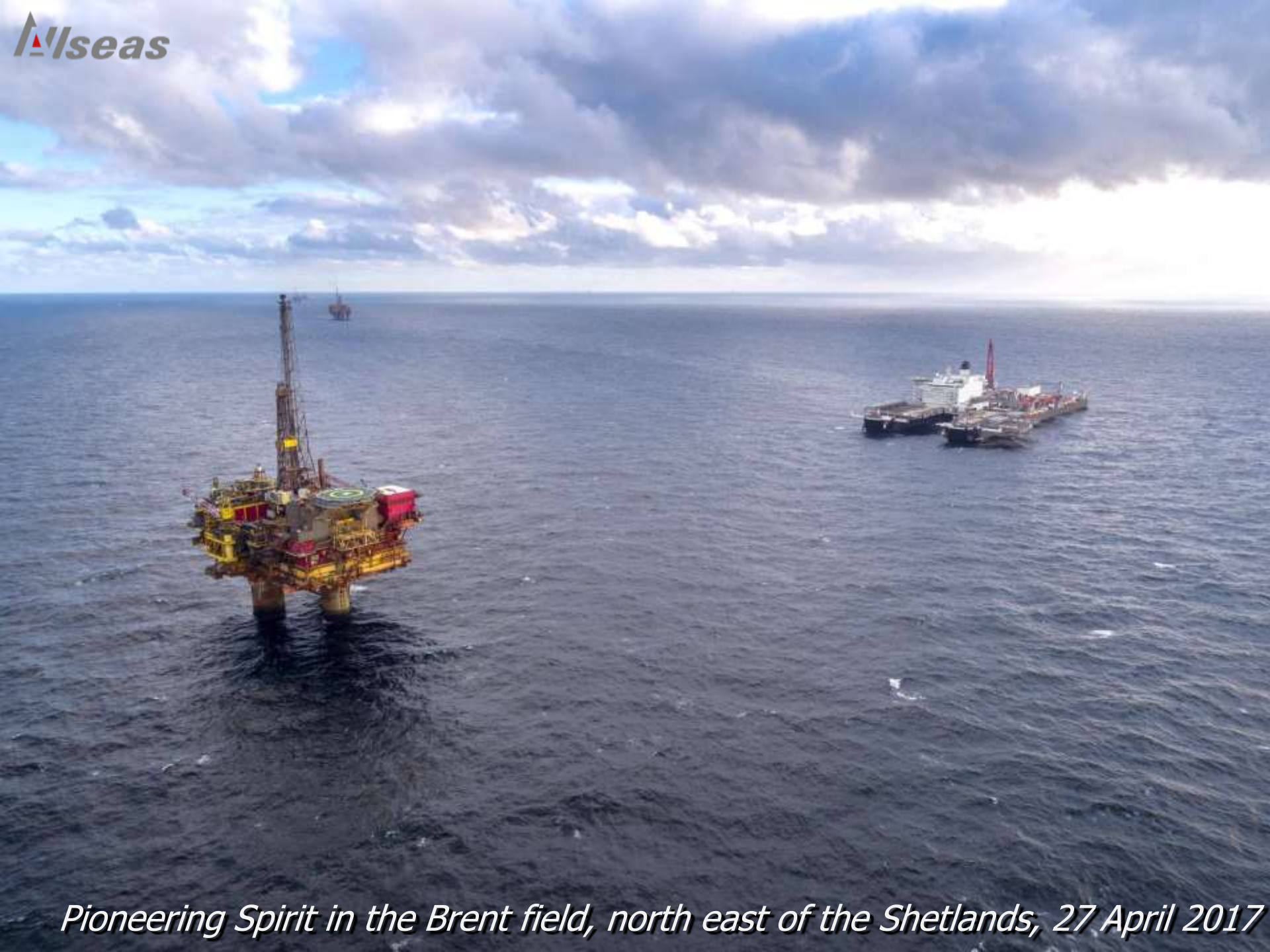
Pioneering Spirit in the Brent field, north east of the Shetlands, 27 April 2017