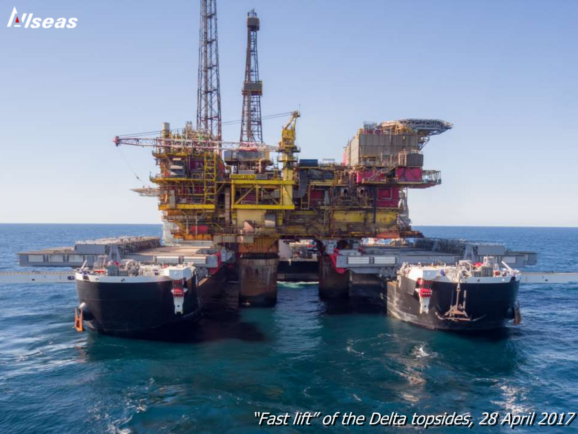
"Fast lift" of the Delta topsides, 28 April 2017