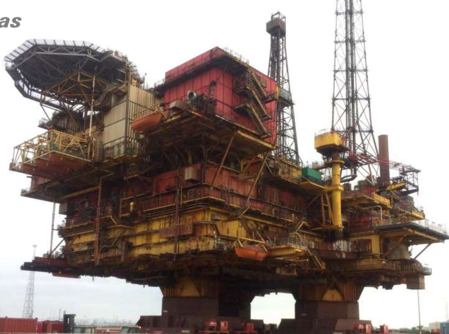
Delta topsides loaded-in to the quay at Able UK, 7 May 2017