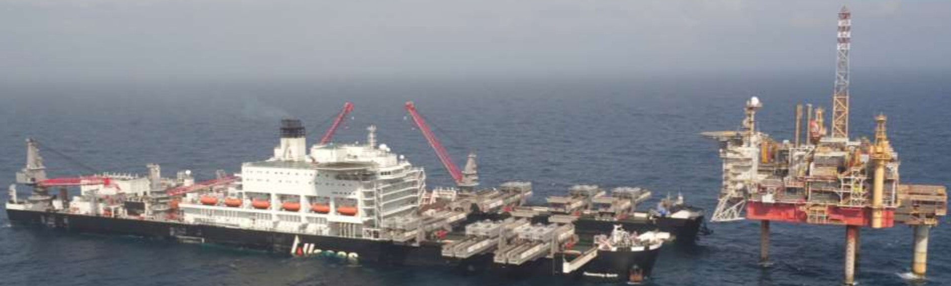
Positioning around the Yme platform, 20 August 2016 Yme field, Norwegian sector of the North Sea