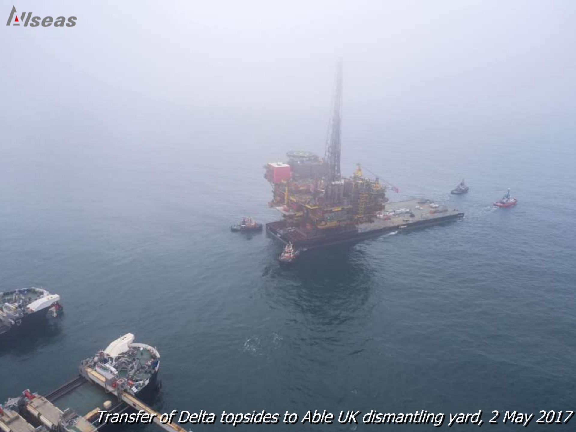
Transfer of Delta topsides to Able UK dismantling yard, 2 May 2017