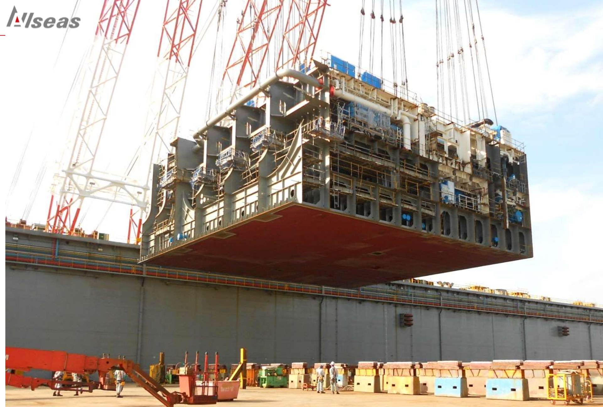
Keel block 12A positioned in royal dock 4, September 2012 Daewoo shipyard, Okpo, South Korea