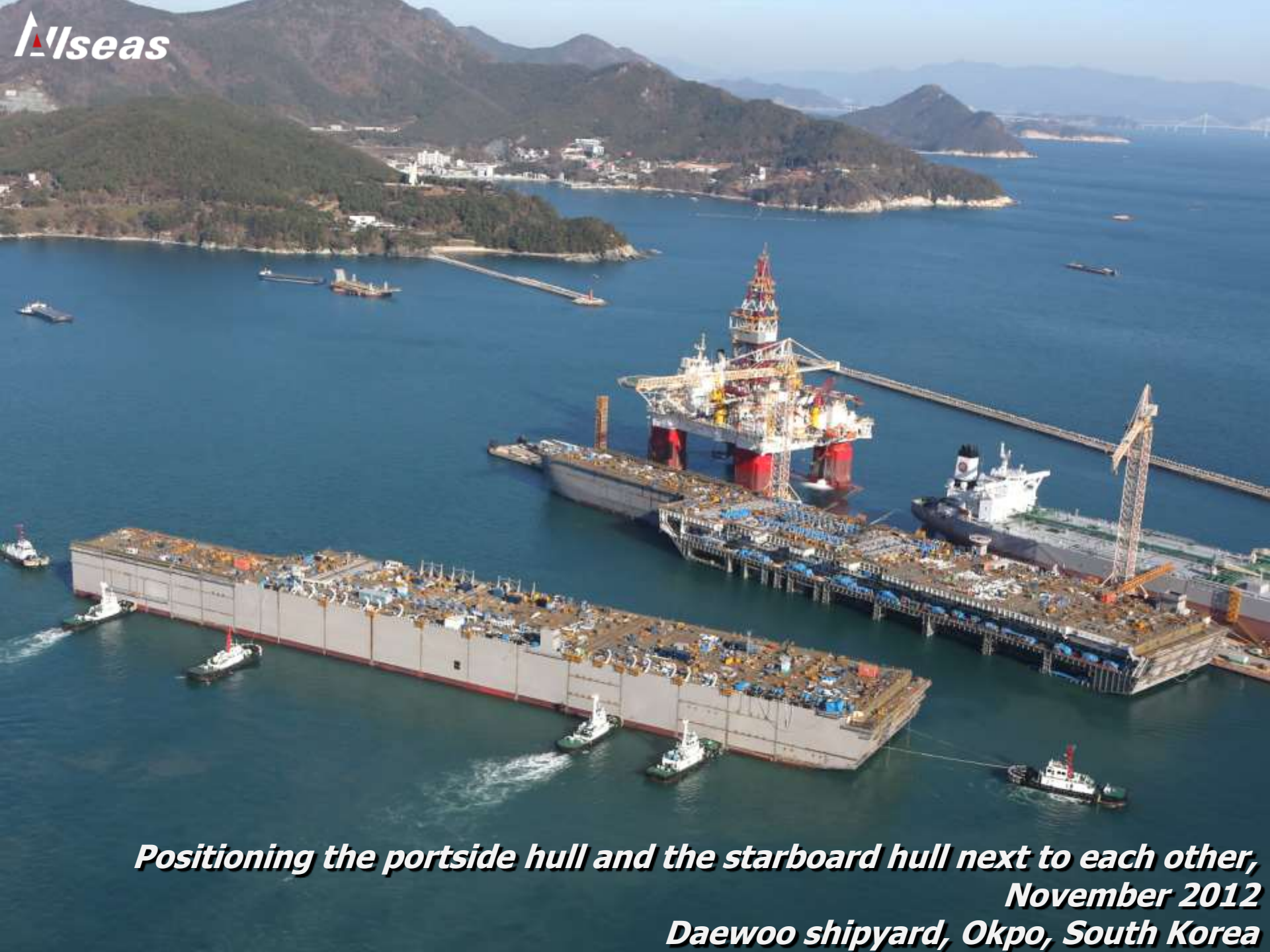
Positioning the portside hull and the starboard hull next to each other, November 2012 Daewoo shipyard, Okpo, South Korea