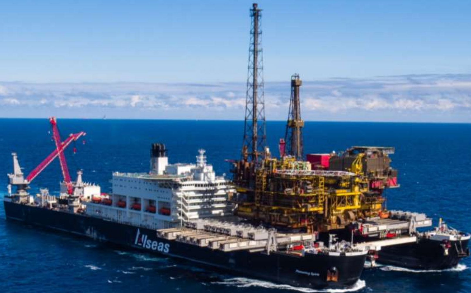
Transport to the dismantling yard, North East England, 29 April 2017