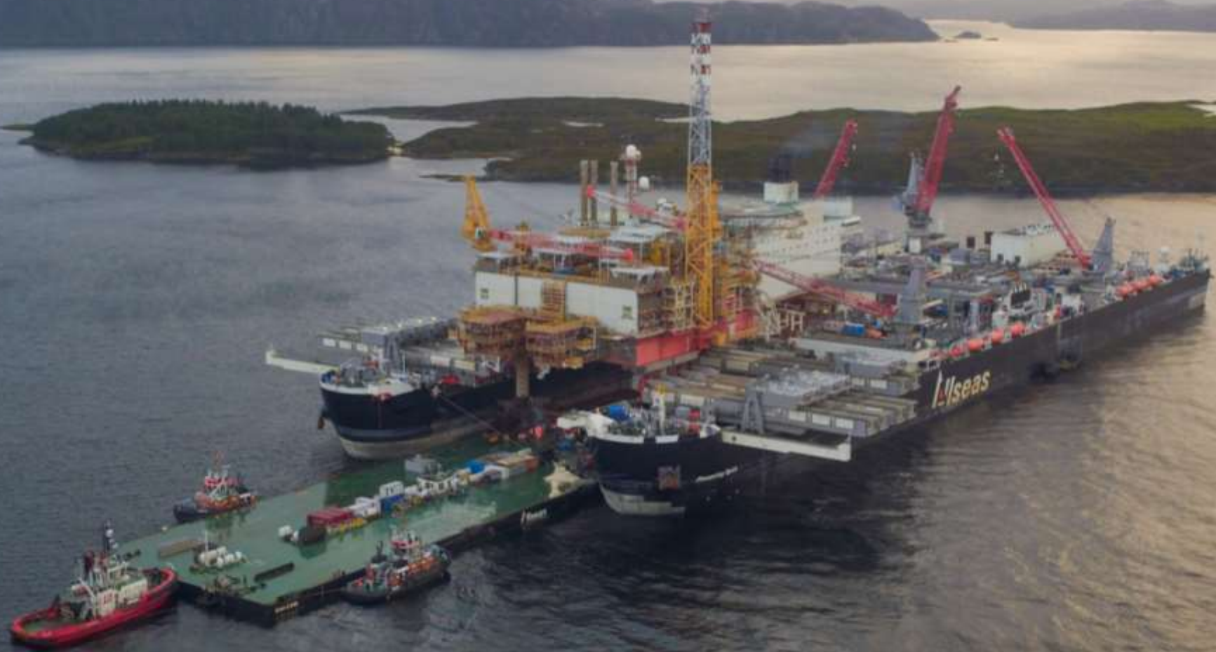
Mooring Iron Lady in the slot for transfer of Yme topsides, September 2016 - Lutelandet, Norway